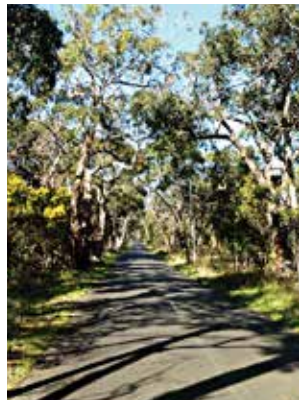
She Oaks Road