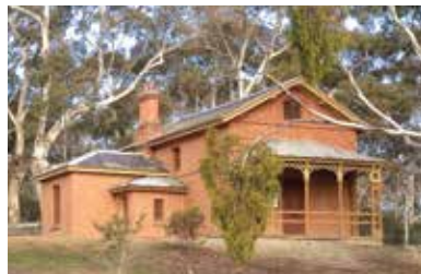
Steiglitz Courthouse, Steiglitz