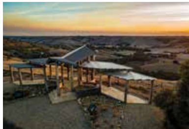
Bunjil's Lookout, Maude.